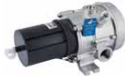
PointWatch Eclipse® IR Combustible Gas Detector