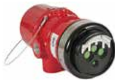
X3301 Multispectrum IR Flame Detector