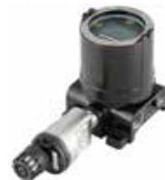
FlexVu® Universal Display with GT3000 Toxic Gas Detector