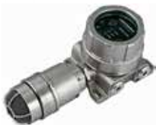
FlexSonic® Acoustic Leak Detector