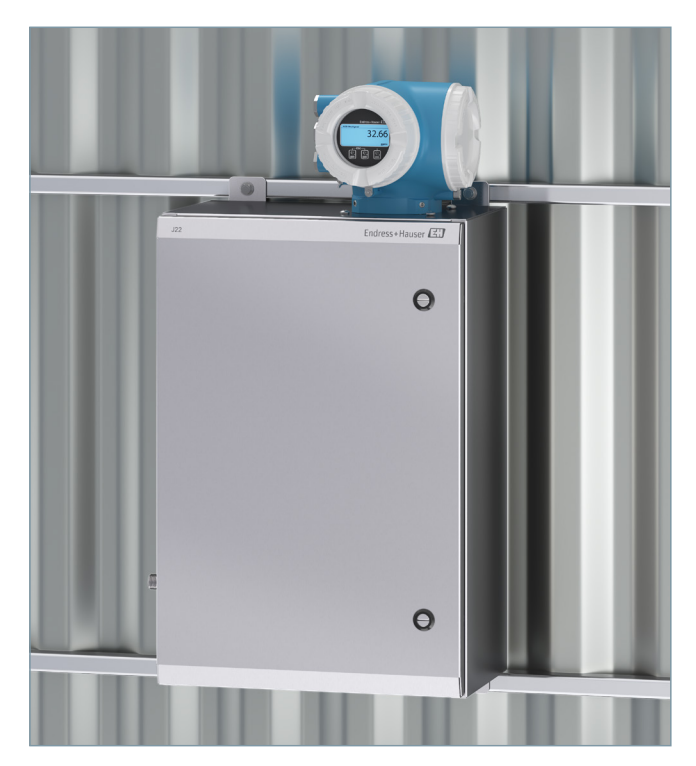
J22 in heated enclosure with sample conditioning system, wall mounted using integral mounting bracket