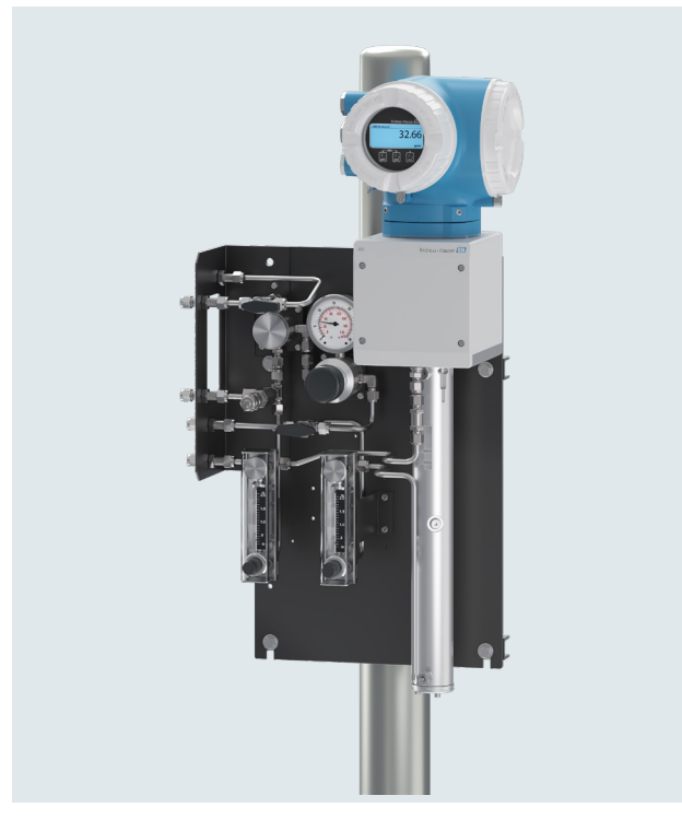
J22 on panel with sample conditioning system, pole mounted using pole mount kit

A variety of system options allow the J22 TDLAS gas analyzer to integrate perfectly into any number of natural gas application locations. Configuration flexibility makes it the most versatile H_2O analyzer on the market!