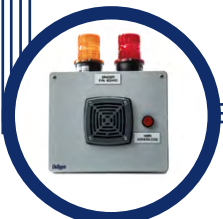
Audible visible alarm devices