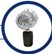
Polytron® 8100 O 2 & toxic gas detector