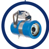
Flame 5000 visual flame detector