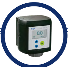
Polytron® 7000 toxic gas detector