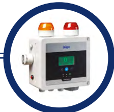
PointGard self-contained LEL & toxic gas detector