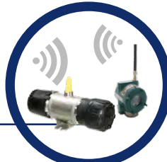
Wireless LEL & toxic gas detector