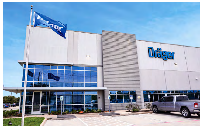
Dräger Houston, TX.

We hold training courses every six months at our Houston System Center. For the schedule, check our website. To register for training at Houston or arrange for classes at your facility, call 1-800-4DRAGER to be connected to our Technical Service team.