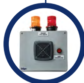
Audible visual alarm device