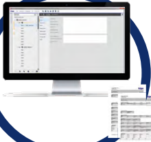
Dräger Polysoft diagnostic software