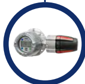
Polytron® 8700 IR LEL detector