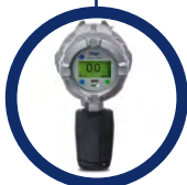
Polytron® 8100 O 2 & Toxic Gas detector