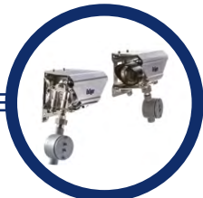
Pulsar 7000 open path detector