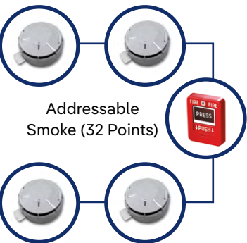
Addressable Smoke (32 Points)