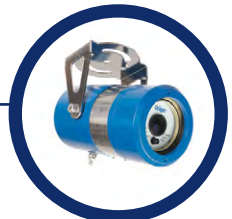
Flame 5000 visual flame detector