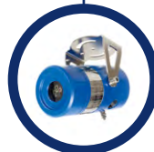
Flame 1500 Triple IR Flame Detector