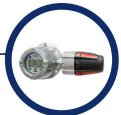
Polytron® 8700 LEL detector