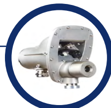
MetCam Optical Gas Imaging