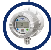
Polytron® 8200 LEL detector