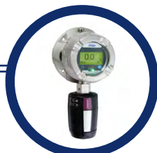
Polytron 8900 UGLD Acoustic Gas Leak Detection