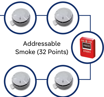
Addressable Smoke (32 Points)