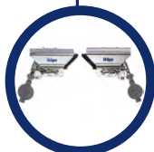
Pulsar 7000 open path detector